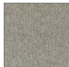
LIGHT GREY D304