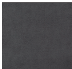
DARK GREY A103