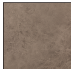
DARK BEIGE F454