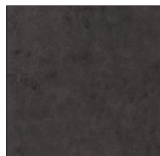
LIGHT BROWN F453