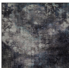
DARK BLUE I045

Colour transfer from cushions and/or clothing does not represent a defect of the material. Deviations in colour and texture are typical of this type of product and do not constitute grounds for complaint.