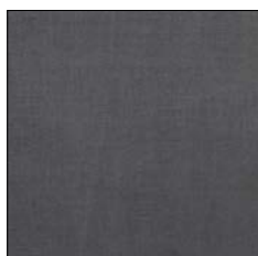
DARK GREY F032