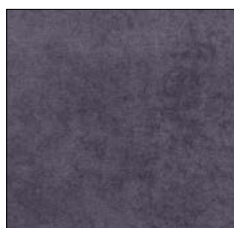
DEEP BLUE G705