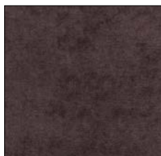
DEEP BROWN G701