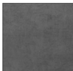
DARK GREY P701