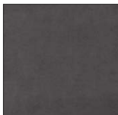
DARK GREY A103