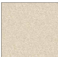
VANILLA ICE F050

Discolouring due to cushions and/or clothing fabrics does not represent a defect of the upholstery fabric. Colour and texture deviations are typical for this product and do not entitle users to any claims. Interaction of pressure, heat and/or humidity may lead to pile displacement (pressure marks). This property is referred to as indentation or seating marks and is a typical feature that does not represent minor quality in any way.