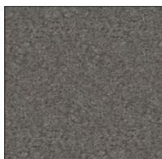
DARK GREY F057