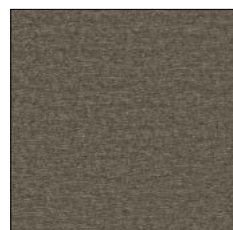
DARK GREY H311