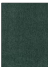
RACING GREEN F196